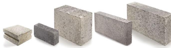
Foundation Block 100mm Ready Brick Medium Dense 140mm Midi Dense 75ml 7n Block 100mm Solid Dense

With the ReadyBlock range of dense and lightweight aggregate blocks you are assured to find the building solution you need. Our blocks can be used with confidence in a wide variety of internal and external applications. Our quality assured manufacture ensures that ReadyBlock units are of a consistent and superior quality to meet the requirements of the relevant British Standards.