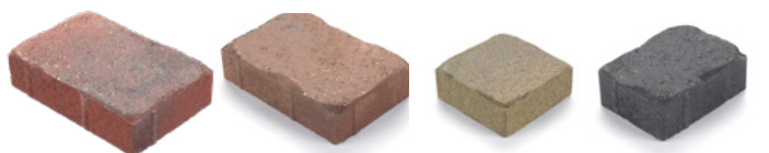
Burnt Ember - Large Autumn Hue - Large Burnt Elm - Medium Charcoal - Small

With a modern twist on our traditional rumbled sett paving, the sustainable-friendly Camden range retains the timeless and classic charm of a traditional stone sett whilst its rustic appearance is soft and subtle.