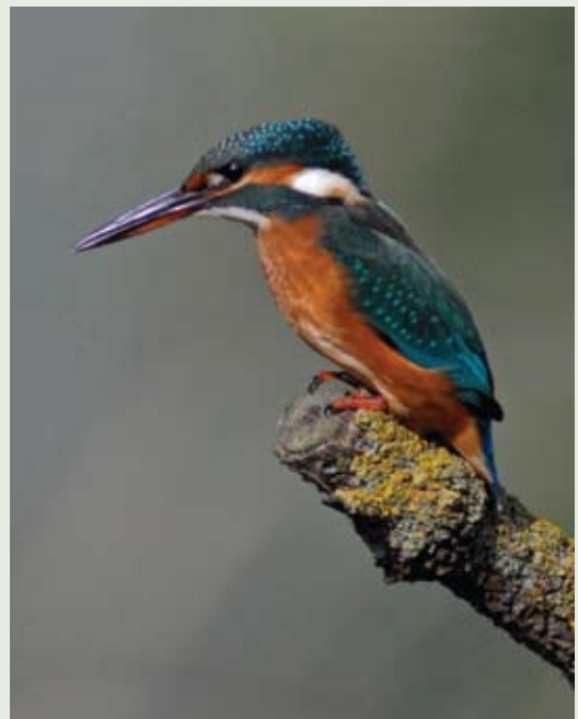
Kingfisher, Alcedo atthis.

and bluebells. Bird life is very rich and diverse and includes great spotted woodpeckers and tawny owls. The adjacent active quarry provides an important breeding habitat for peregrine falcons.