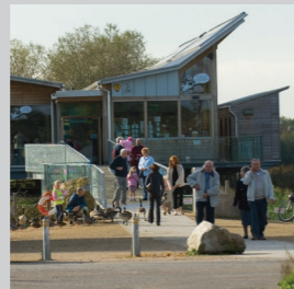
The award-winning Attenborough Nature Reserve, restored from an old CEMEX quarry.