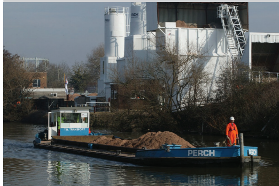
CEMEX is the first company to introduce major freight transport on the River Severn in over 30 years. Over 10 years, a total of nearly 3 million tonnes of aggregate will be carried by barge saving 34,000 lorry journeys.

To drive these activities we have a commitment to data collection and the measurement of environmental performance. We also restore land used for extraction and recycle water used for stone washing and aggregate reclamation. It all adds up to industry leading environmental performance.